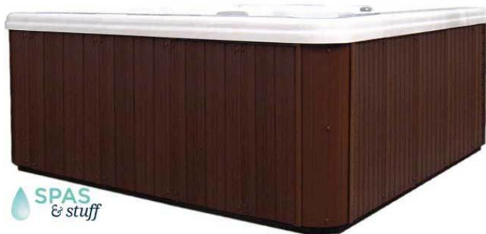
Beautiful Synthetic Cabinet Walnut