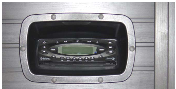
Weatherproof Stereo AM/FM/CD/MP3 Player