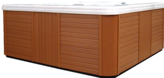
Beautiful Synthetic Cabinet Walnut